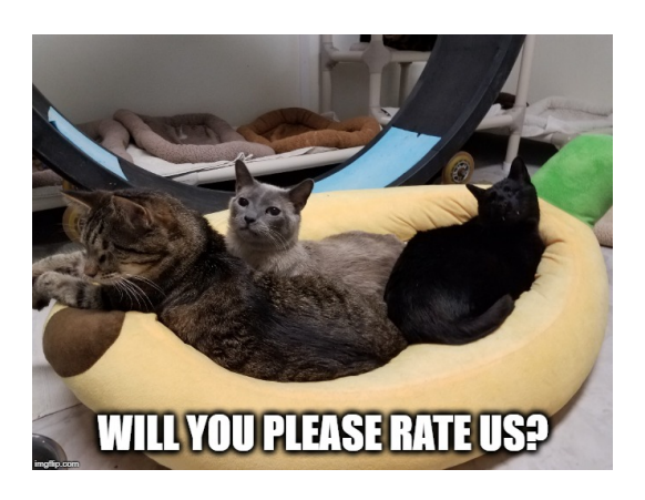
The Cats want to Make the Top 10!

Have an old car, truck, van, SUV, boat, motorcycle, ATV, RV, trailer or even an airplane? Donate it BCR! Find out how to do it here.