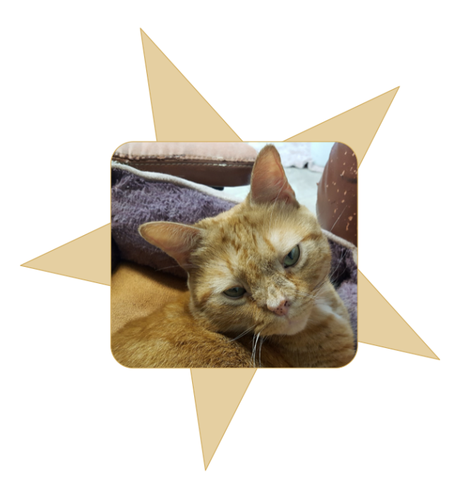
Bunny is a Star!

\underline{\textbf{CLICK HERE}}\ \text{to learn why talking to your cat is a healthy habit for you and your cat!}