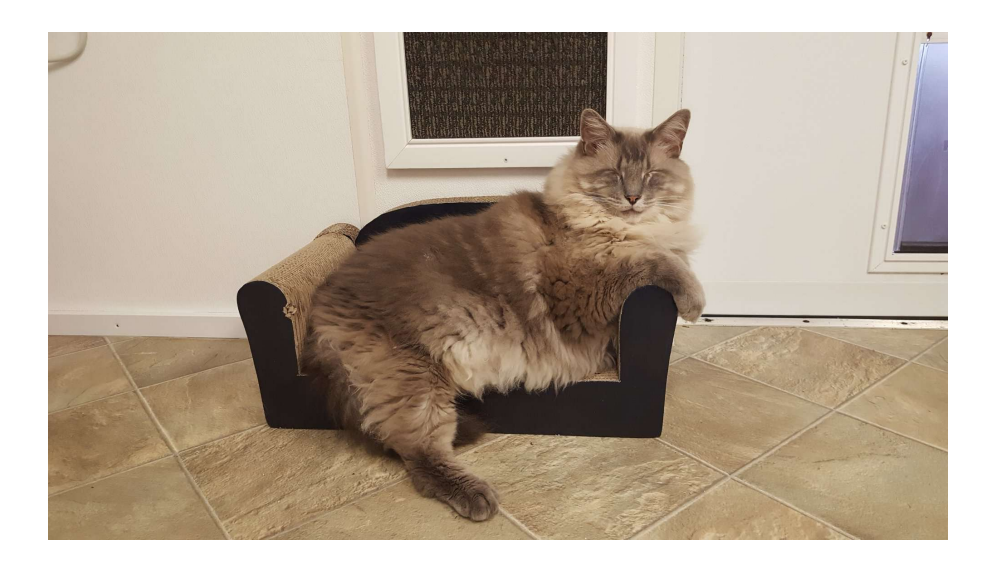
You Aren't Crazy - Talking to Your Pets is a Good Thing!

CLICK HERE to learn about choosing furniture cats won't scratch!