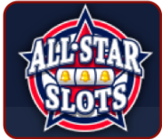
All-Star Slots Contest

Thank you so much to everyone who votes and shares every day! We have two contests going on now and we need YOU to help the cats win!