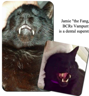
Jamie "the Fang," BCR's Vampurr, is a dental superstar!

Here are some things to be aware of and to watch for.