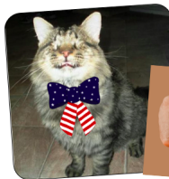
Snicker Wants to Hear from YOU!

Read one pet owner's experience with oral cancer here.